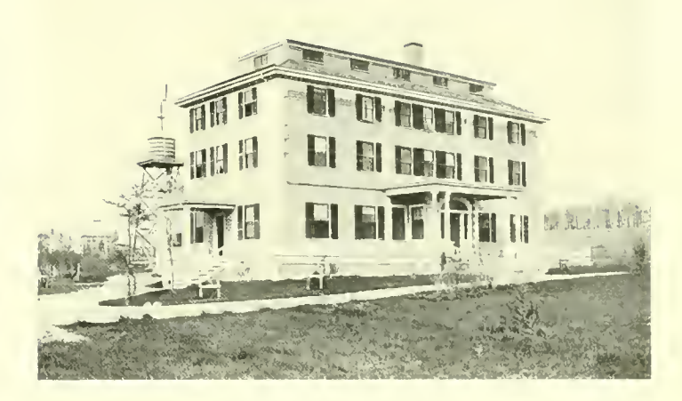
Powder Point School.