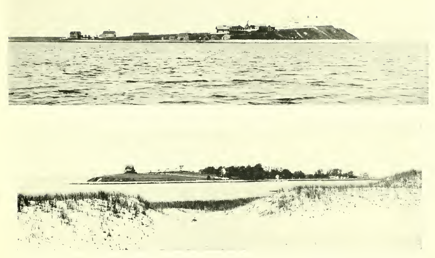
CLARK'S ISLAND. THE GURNET. Clark's Island is known to all readers of Pilgrim history as the spot where the exploring party from the Mayflower spent their first Sabbath, Dec. 20, 1620. From Pulpit Rock on this island, says the legend, their first sermon was preached. The Gurnet headland at the entrance to the harbor has a lighthouse and a life-saving station.