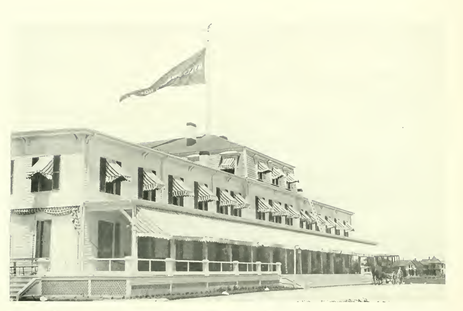
MYLES STANDISH SPRING HOTEL, situated upon a bluff of the old Myles Standish farm, celebrated now as a high-class summer resort. Directly on the property is the famous MyLES STANDISH SPRING, which supplies all the water for the hotel, and is sold throughout the United States.